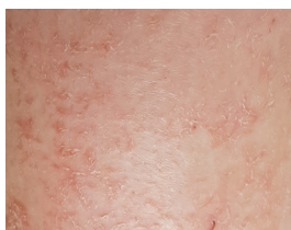
BEFORE USING RASH RELIEF