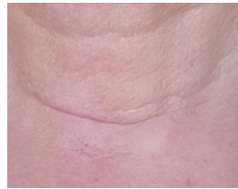
6 MONTHS OF USING REPAIR MOISTURISER

In 2018 I had a cancer tumour removed from my thyroid gland leaving me with a very swollen, red scar around my neck. I started applying Angelic Skin REPAIR MOISTURISER morning and night (3 days after surgery). I was amazed how effective the moisturiser was after using it for one week only. The swelling had reduced and the scar tissue had decreased in size and colour.