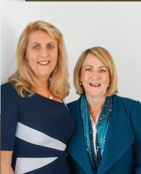
LIBBY AND ANNE

angelic SKIN pure & natural RASH RELIEF A natural soothing and moisturising cream Chlorox Free Hypoallergenic Non-toxic 100ml e