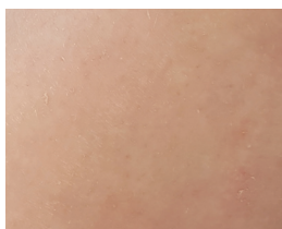
AFTER USING RASH RELIEF

As a teenager and studying my final year of high school, my stress levels were extreme. I have a history of severe eczema problems. I had eczema patches all over my body (including my lower legs) and flare-ups were very common (particularly when I felt stressed). This made me feel embarrassed when out in a public place. It really affected my self-worth and self-esteem.